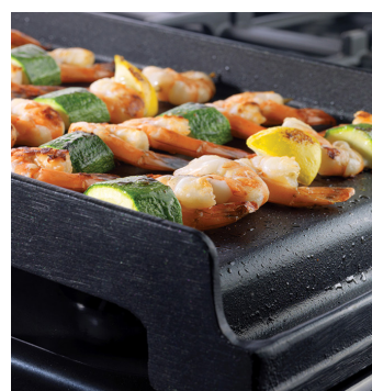
Teppanyaki Style Gridle Plate (gas hob only)