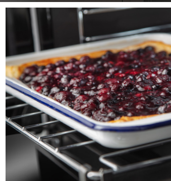
*NEW - telescopic rails (full oven mode)