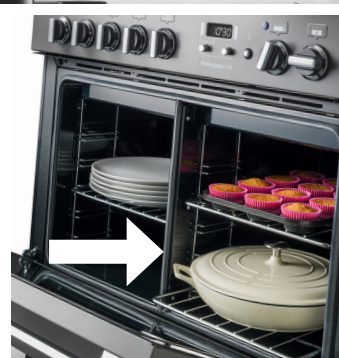
Energy saving panel