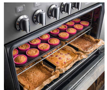
Pyrolytic cleaning - Carbonises cooking residue for easy cleaning (FXP only)

KEY: « Multi ring wok burner, > Litres based on European Standards | Measurements, *Using assessed maximum demand. Not all zones can be used at once. Consult with a licensed electrician.