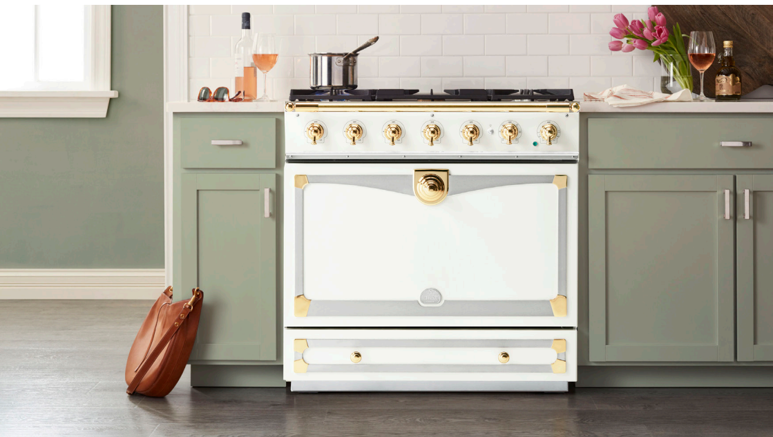
Albertine 90 in Pure White with Polished Brass and Stainless Steel

The CornuFé 110 and Albertine 90 cookers offer the perfect opportunity to enter the wonderful world of La Cornue cuisine.