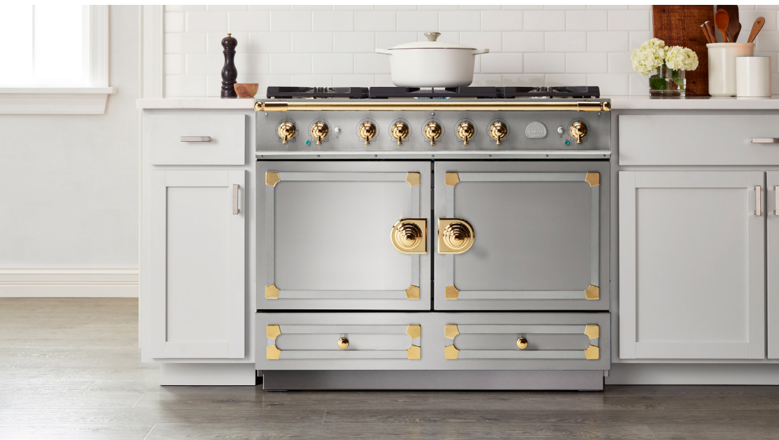
CornuFé 110 in Stainless Steel with Polished Brass and Stainless Steel

Marvellously combining the La Cornue tradition with technological innovation, these range cookers are, above all, the result of a passion: The passion of culinary art.